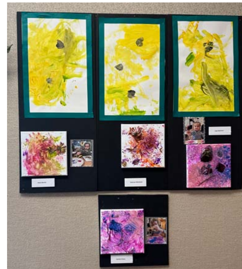
exhibit captured the essence of childhood wonder, creativity, and expression. Flower City was not just an event; it was a gateway to a world where imagination knows no limits and where the beauty of art blossoms in the hearts of our youngest creators.

just an event for the students; it was an occasion that brought families, teachers, and the community together. Parents marveled at the boundless creativity displayed by their little ones, while the educators beamed with pride, witnessing the growth of the children